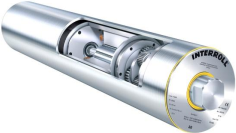
Interroll Synchronous Drum Motor